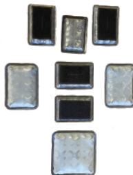
Adjust Side Pads for Optimized Fit