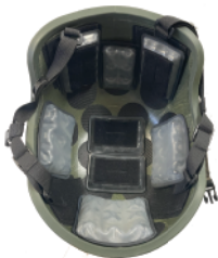
Standard Pad Layout